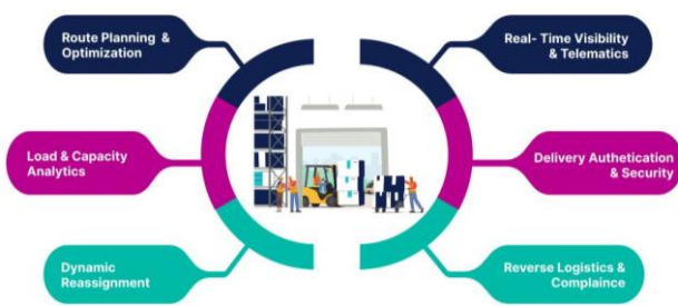
Fig. 3. Integrated comparative model of last-mile delivery challenges

In order to summarize these findings, we can offer the overall comparative scheme of the issues of last-mile delivery in Figure 3.