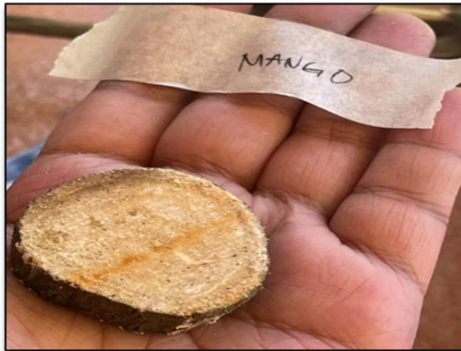
Figure 1. Mango Xylem Filter