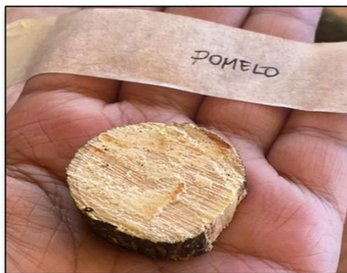
Figure 2. Pomelo Xylem Filter