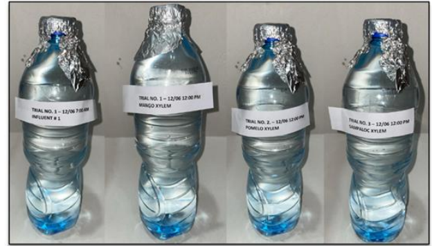
Figure 5. Influent and Effluent Water Collected for Physico-chemical Analysis