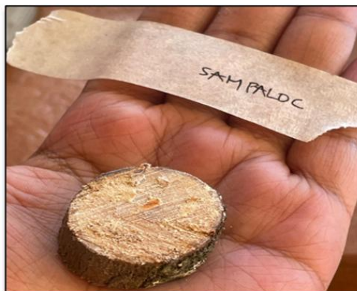
Figure 3. Sampaloc Xylem Filter