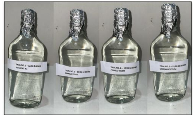
Figure 6. Influent and Effluent Water Collected for Bacteriological Analysis