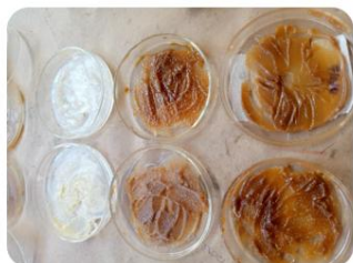
Fig. 4. Microbiological test of balm (E2023) in petri dish

The results of the microbiological tests after incubation of each petri dish show the total absence of bacterial germs and yeasts for up to 72 hours (Fig. 4).