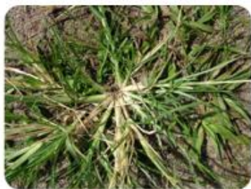
Fig. 1. Eleusine indica (L) Gaertn plant

The plant material ( Eleusine indica (L) Gaertn) consists of the whole plant (coded E2023), were collected in May 2023 from Antananarivo, Madagascar (Fig. 1). After harvesting, they were washed, then dried and ground into powder.