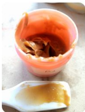
Fig. 5. Anti-inflammatory balm (E2023) with Eleusine indica extract.

These results demonstrate the sterility and stability of the balm preparation (E2023) in compliance with the conditions of Good Manufacturing Practice (Fig. 5).