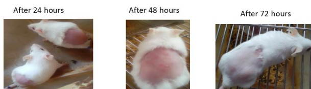
Evaluation of the Primary Irritability Index